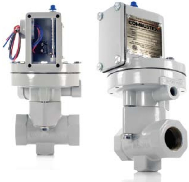
C/I Proof of Closure Safety Shutoff Valve