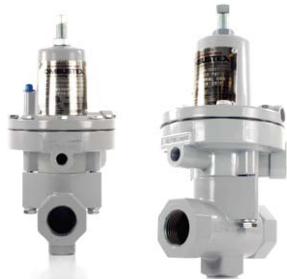
C/I Standard Safety Shutoff Valve